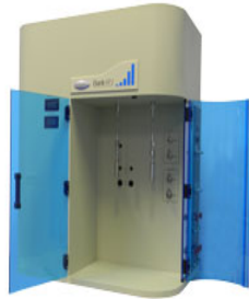
High Pressure Gas Sorption