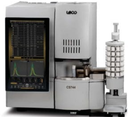
CS744 with optional autoloader