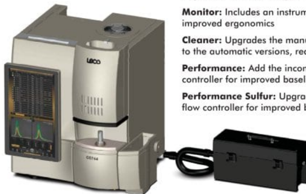
CS744 with high-velocity vacuum system

Performance Sulfur: Upgrades the standard flow controller with a thermally stabilized flow controller for improved baseline stability and precision